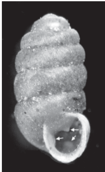
Fig. 2. A specimen of Pupilla cf. sterrii (2.7 x 1.5 mm) from station C1. Arrows point at the teeth.

Fig. 2. Ejemplar de Pupilla cf. sterrii (2,7 x 1,5 mm) de la estación C1. Las flechas señalan los dientes.