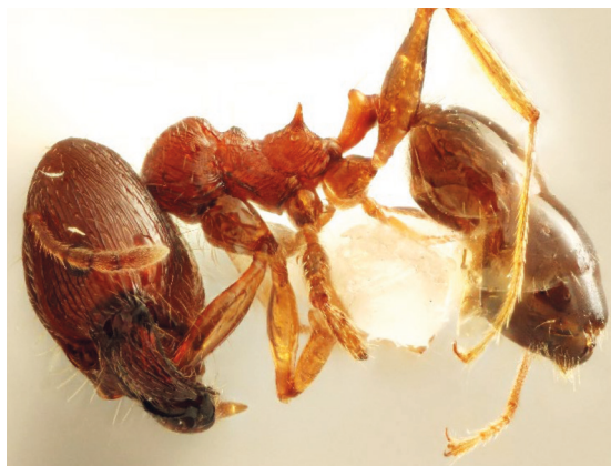
Fig. 2. Soldier worker of Pheidole indica .