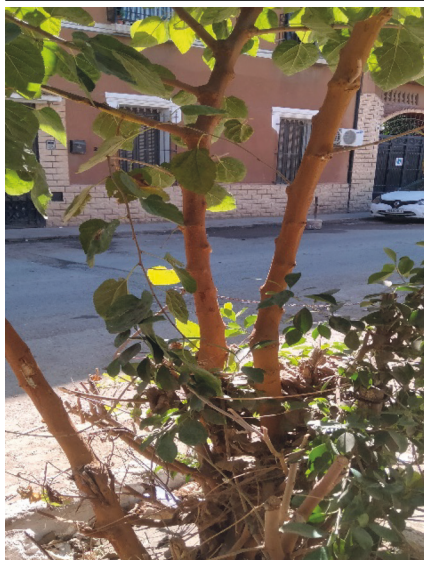
Fig. 1. Image of study area (Algiers, Algeria) Morus alba where Pheidole indica was detected.

Fig. 1. Imagen del área de estudio (Argel, Argelia). Morus alba , donde se localizó Pheidole indica .