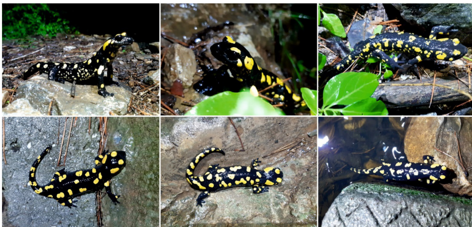
Fig. 2. Specimens of S. s. longirostris adults found during sampling.